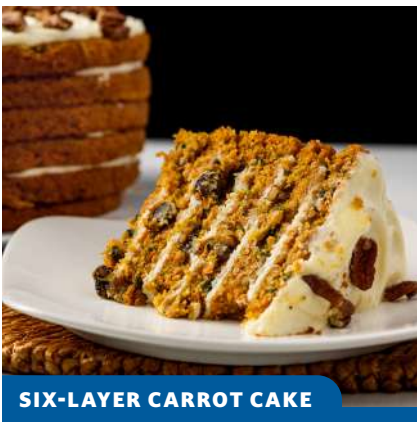
SIX-LAYER CARROT CAKE

Five-Layer Lemon Cake, Lemon Curd, Vanilla Icing, Dried Marshmallow Bits, Sour Lemon Bark