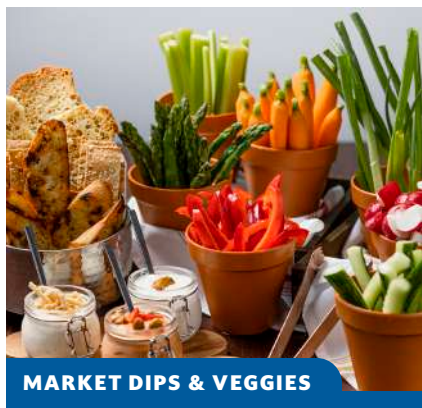
MARKET DIPS & VEGGIES