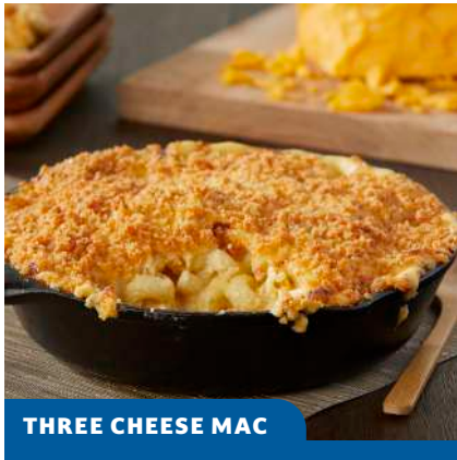
THREE CHEESE MAC

Pulled Chicken, Home-Made Buffalo-Style Hot Sauce, Mini Rolls, Cool Celery Blue Cheese Slaw