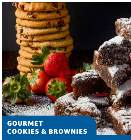
GOURMET COOKIES & BROWNIES

You will know when the legendary dessert cart is nearby. Just listen for the 'oohs' and 'ahs' as your neighbors line up in enthusiastic anticipation of our signature dessert cart.