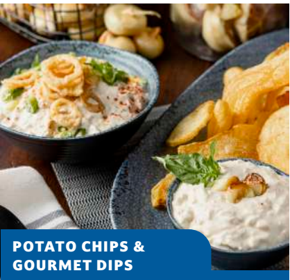
POTATO CHIPS & GOURMET DIPS

Levy is just one call away and a Culinary or Premium Specialists Representative will gladly offer recommendations and/or honor special requests towards a gluten-free diet.