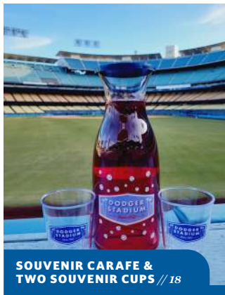
SOUVENIR CARAFE & TWO SOUVENIR CUPS // 18